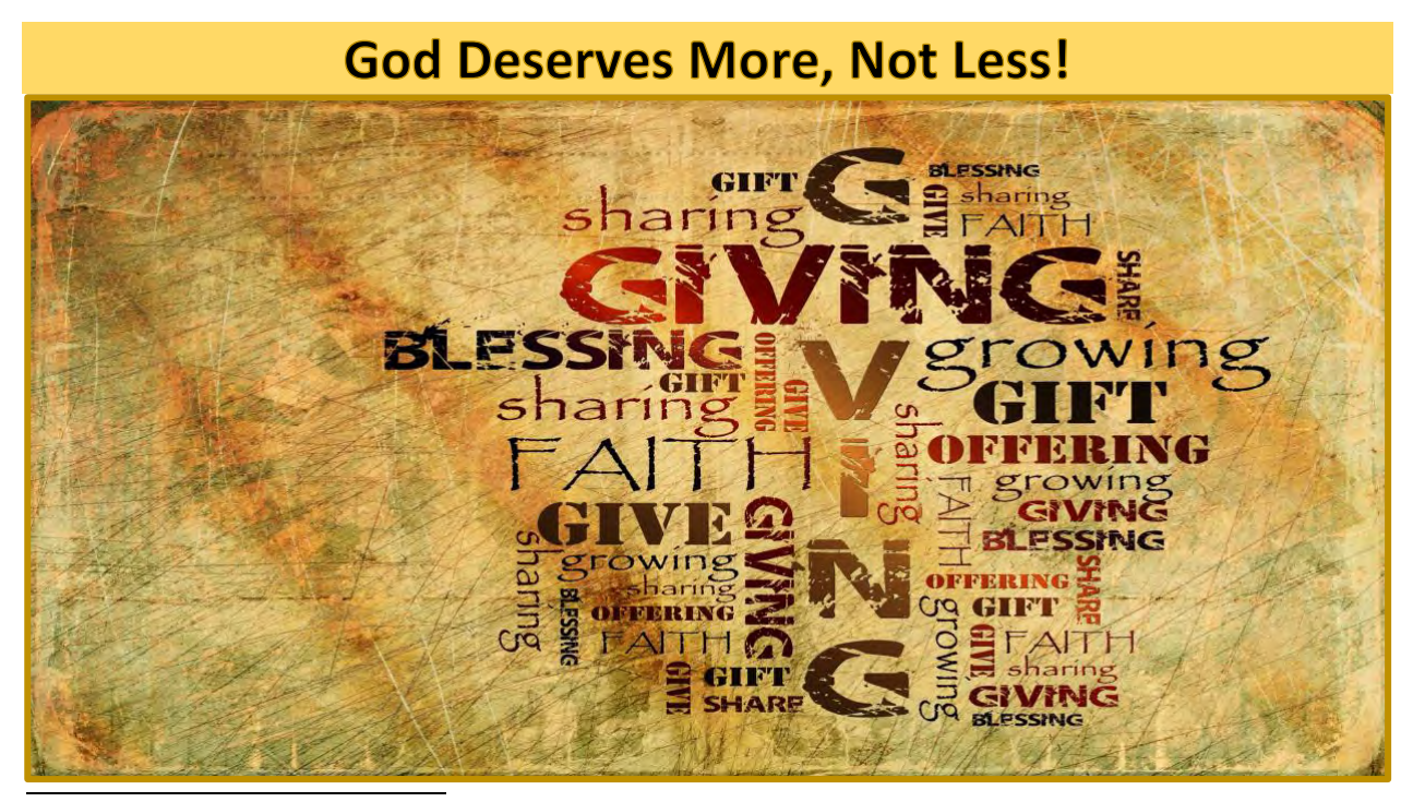
<sup>2</sup> A Fable #110 © 1978, 1993 Neibauer Press

As they rose to go, the pastor thought, "We tip the waitress 15%. Otherwise, she'll think we're cheap or ungrateful. Her opinion must matter to us more than God's opinion of us, because we leave Him only 2%! Yet He gives us the bread of life and the water of salvation."